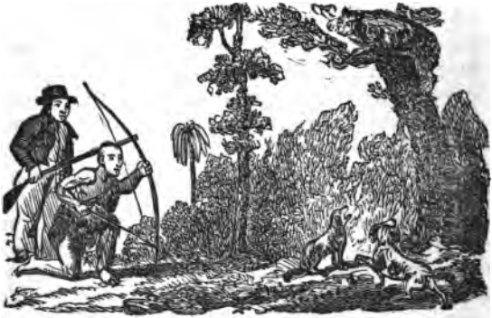
Thompson and one of the Indians shooting a Bear.

it is generally covered when killed, it is brought in and seated opposite the king in an upright posture, with a chief's bonnet, wrought in figures on its head, and its fur powdered over with the white down. A tray of provision is then set before it, and it is invited by words and gestures to eat. This mock ceremony over, the reason of which I could never learn, the animal is taken and skinned, and the flesh and entrails boiled up into a soup, no part, but the paunch being rejected.